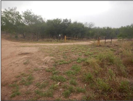
Photograph 7 – View looking northwest at the entrance to Reported Site 7, Lower Rio Grande National Wildlife Refuge.