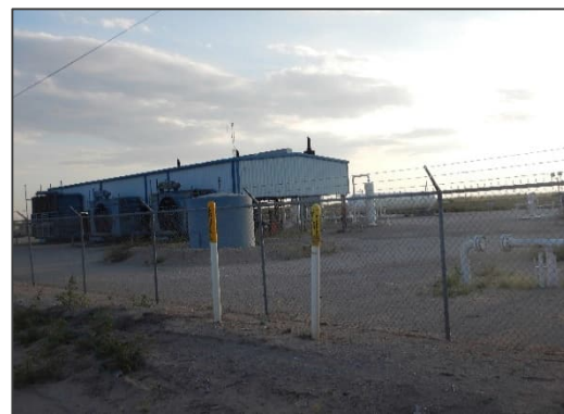
Photograph 13 – View looking southwest at Unreported Site 5, Energy Transfer Raymondville Facility.