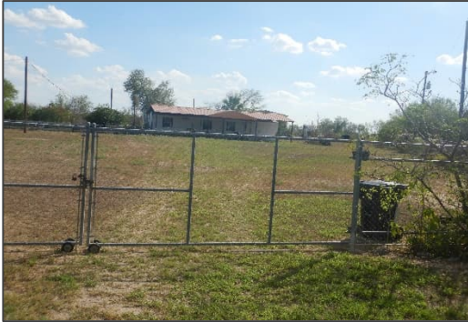
Photograph 1 – View looking south at the former location of Reported Site 1, Quintanilla Tire Shop. The site is no longer active and is a private residence.

The following photographs depict sites that were identified in the EnviroSite Government Records Report dated 03/21/2023. Reported Sites 6 and 8 could not be directly observed in the field due to a lack of right-of-entry permissions from the respective property owners.