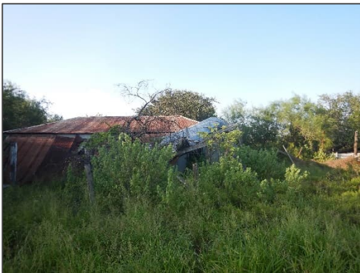
Photograph 8 – View looking north at an abandoned and collapsed structure at the entrance of Reported Site 9, Raymondville Historical Landfill.

[The remainder of this page is intentionally blank.]