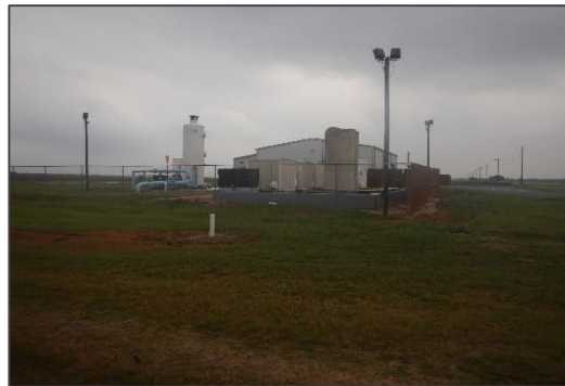
Photograph 5 – View looking east from the existing Raymondville Drain at Reported Site 5, North Alamo Water Supply Corporation Reverses Osmosis Wastewater Treatment Plant.