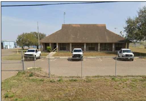
Photograph 2 – View looking east at Reported Site 2, Tennessee Gas Company.