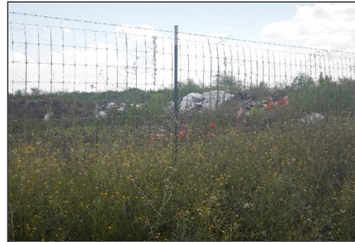
Photograph 12 – View looking southeast at construction debris located at Unreported Site 3.