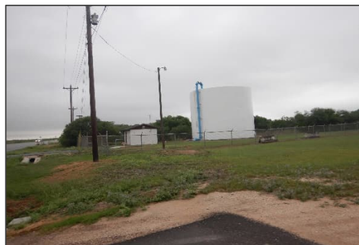
Photograph 6 – View looking west at an above-ground storage tank associated with Reported Site 5.