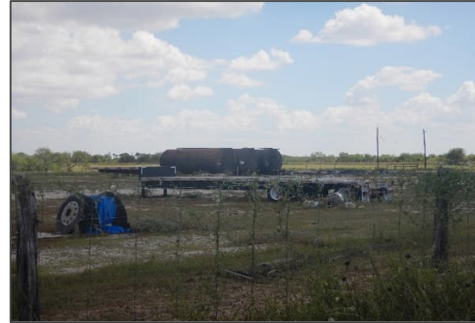
Photograph 4 – View looking southeast at oil tankers located near the entrance of Reported Site 4, Rio Farms Gas Plant. The site was inaccessible due to a lack of right-of-entry permissions.