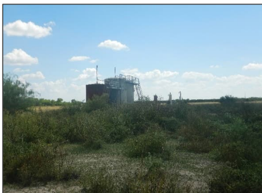
Photograph 10 – View south at tank batteries located at Unreported Site 2. This photograph was taken from a publicly accessible roadway.