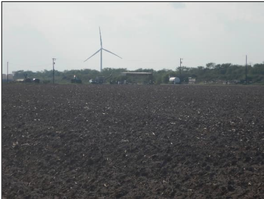
Photograph 15 – View looking northwest at Unreported Site 7, a farming staging area. This photograph was taken from a publicly accessible roadway.

[The remainder of this page is intentionally blank.]