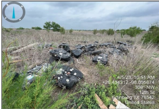
Photograph 9 – View northwest at Unreported Site 1, discarded gas tanks located along 12 th Street.

The following photographs depict the sites that were identified during field investigations but were not listed in the Envirosite Government Records Report. Unreported Site 4, Dallas Petroleum Group Oil and Gas Facility, was not directly investigated in the field due to lack of right-of-entry permissions from the property owners.