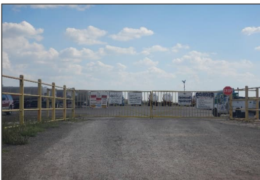
Photograph 3 – View looking south at the entrance to Reported Site 3, Key Energy Service.