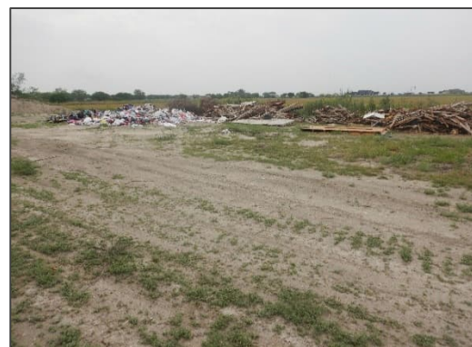
Photograph 14 – View looking south at Unreported Site 6, an illegal dumping area located within the RDP study corridor.